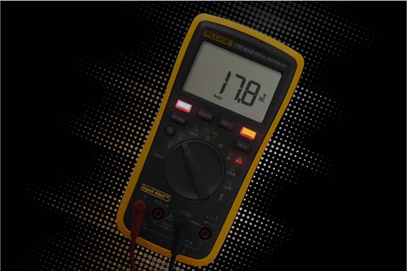
Audible and visual alarm for incorrect connections